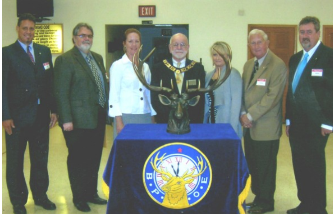
Elks Install New Members