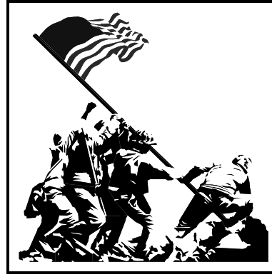
REMEMBER ALL OUR VETERANS