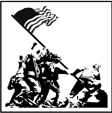
REMEMBER ALL OUR VETERANS